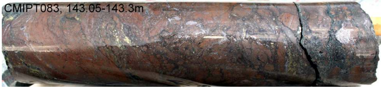
Figure 3. Hole CMIPT083: massive and brecciated massive sphalerite with lesser galena (red-brown). Up to 3% chalcopyrite (yellow) is present in places.

Hole CMIPT085 was drilled to about 40 metres below surface in an area of little drilling about 70 metres along trend to the south of the massive sulphide lens at Main Shaft (Figure 4). This hole intersected 1.5 metres true width of brecciated massive pyrite with sphalerite, galena and minor chalcopyrite in places. This is the first indication of massive sulphide in this area and is encouraging.