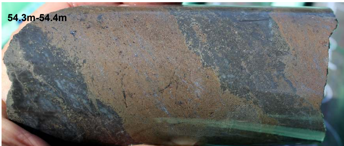
Figure 2. Hole CMIPT084: Photographs of end-member styles of massive sulphide mineralisation: massive pyrite (bronze colour) with fine grained sphalerite and galena (upper) and massive sphalerite (red-brown) with galena (silver grey) (lower). Similar styles of mineralisation occur in all four drill holes at Main Shaft.

Hole CMIPT082 was drilled 20 metres down dip from previous high grade drill intercepts 2 and intersected two metres true width of semi-massive sulphide with a 50 cm thick band of sphalerite-dominant massive sulphide from 96.8 metres down hole.