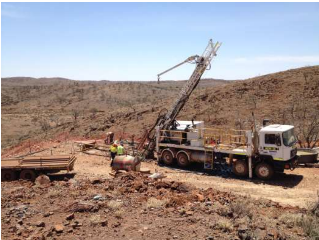
Drilling at the Red Hill Prospect

Impact recently earned a 51% in the rights to nickel-copper-PGE mineralisation from Golden Cross Resources Limited (GCR) and has elected to earn an 80% interest by spending a further $200,000. This will be completed during this programme.