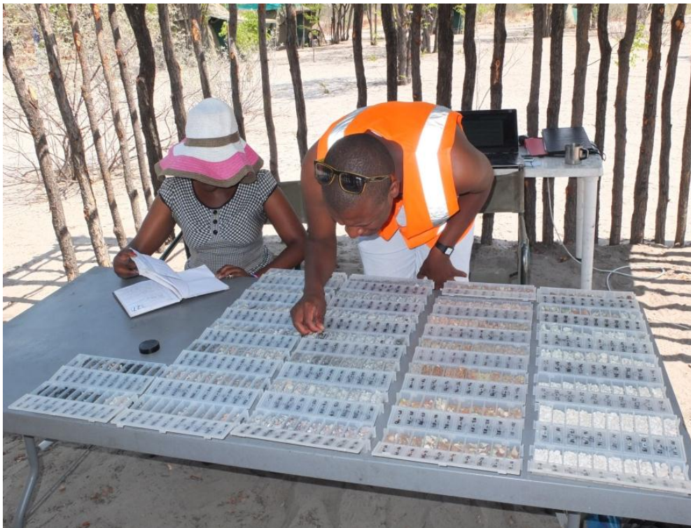
Figure 3. Logging of drill chips.