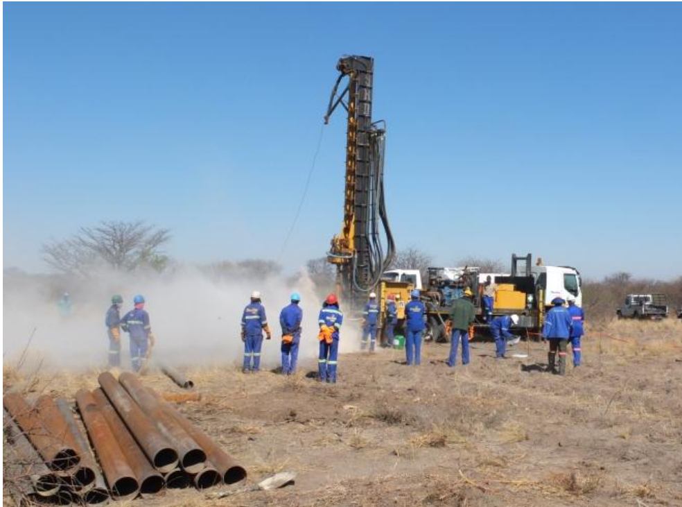
Figure 2. Drilling in Progress.