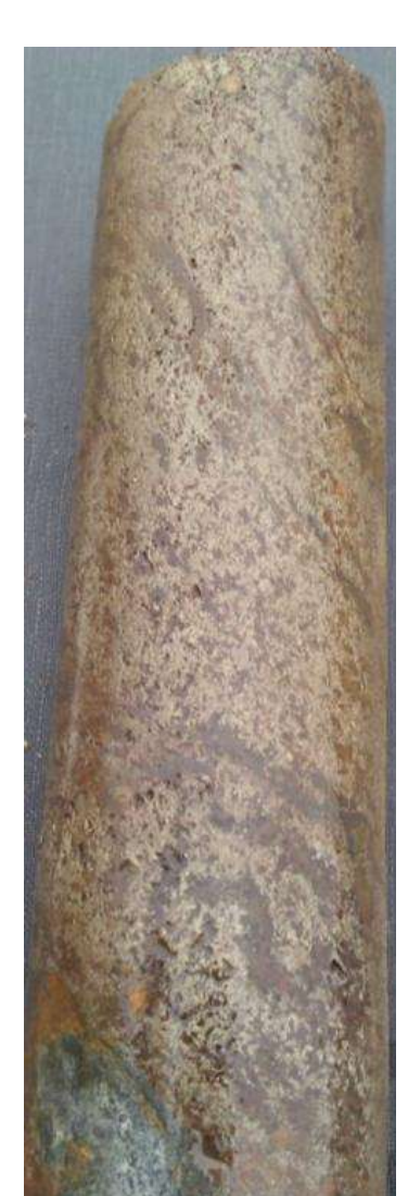
Figure 2. Massive sulphide with nickel and copper from 58 m

The newly discovered mineralisation in RHD006, which includes a 0.5 m wide zone of massive sulphide with nickel and copper sulphides (Figure 2) occurs above the recently reported high-grade copper-nickel-platinum group element (PGE) mineralisation from RHD001 that returned an intercept of: