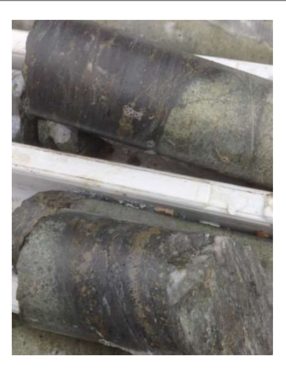
Figure 1. Examples of veins from CMIPT043. On the left, quartz-sulphide vein in altered porphyry. On the right, two veins with semi-massive sulphides of zinc, lead and iron (pyrite and arsenopyrite).

The mineralisation comprises numerous veins and stockworks of quartz with variable amounts of zinc, lead and pathfinder sulphide minerals that occur within the Silica Hill rhyolite (Figure 1).