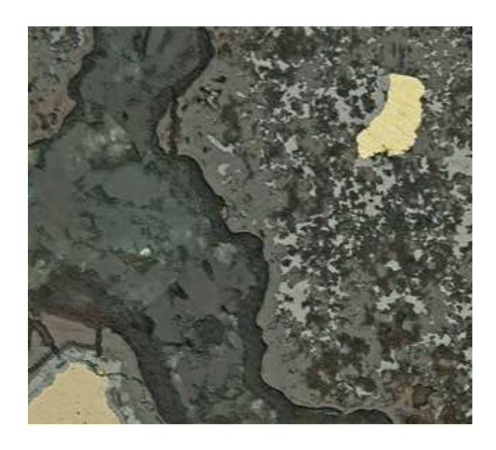
Figure 2. Native gold in top right corner with pyrite (cream) and chalcocite (grey) in bottom left corner. Gold grain is about 50 microns in dimension. Sample of partly weathered sulphide-quartz vein from 57.6 m down hole in RHD001.

Native gold has also been identified for the first time in the drill core in recently completed petrographic work. This is encouraging for the discovery of further gold at depth where an induced Polarisation (IP) anomaly has been identified (Figure 2).