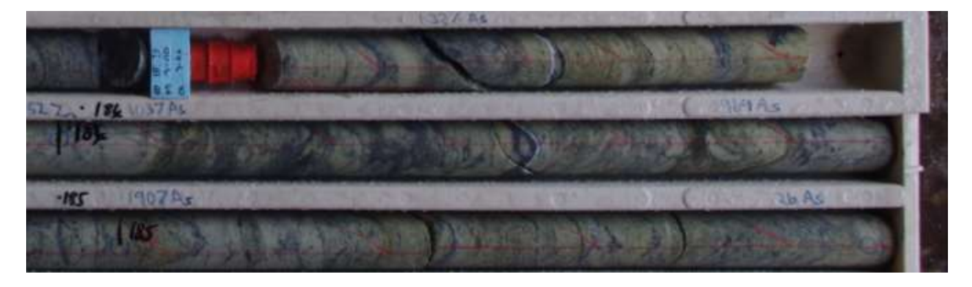
Figure 1. Typical style of sulphide mineralisation (darker zones and veins) in Hole CMIPT049 at about 184 metres down hole.

The mineralisation comprises multiple narrow stockwork-style veins and veinlets together with disseminated sulphides in the rock surrounding the veins (Figure 1). Readings with a portable XRF instrument on both holes (CMIPT048 and CMIPT049) indicate silver mineralisation of more than 100 g/t occurs in many places both in the veins and the surrounding rock. Although the mineralisation is visually similar to that encountered in previous drill holes, silver minerals were not observed (see announcements dated <u>31st August</u>, <u>2nd September</u> and <u>13th September 2016</u>).