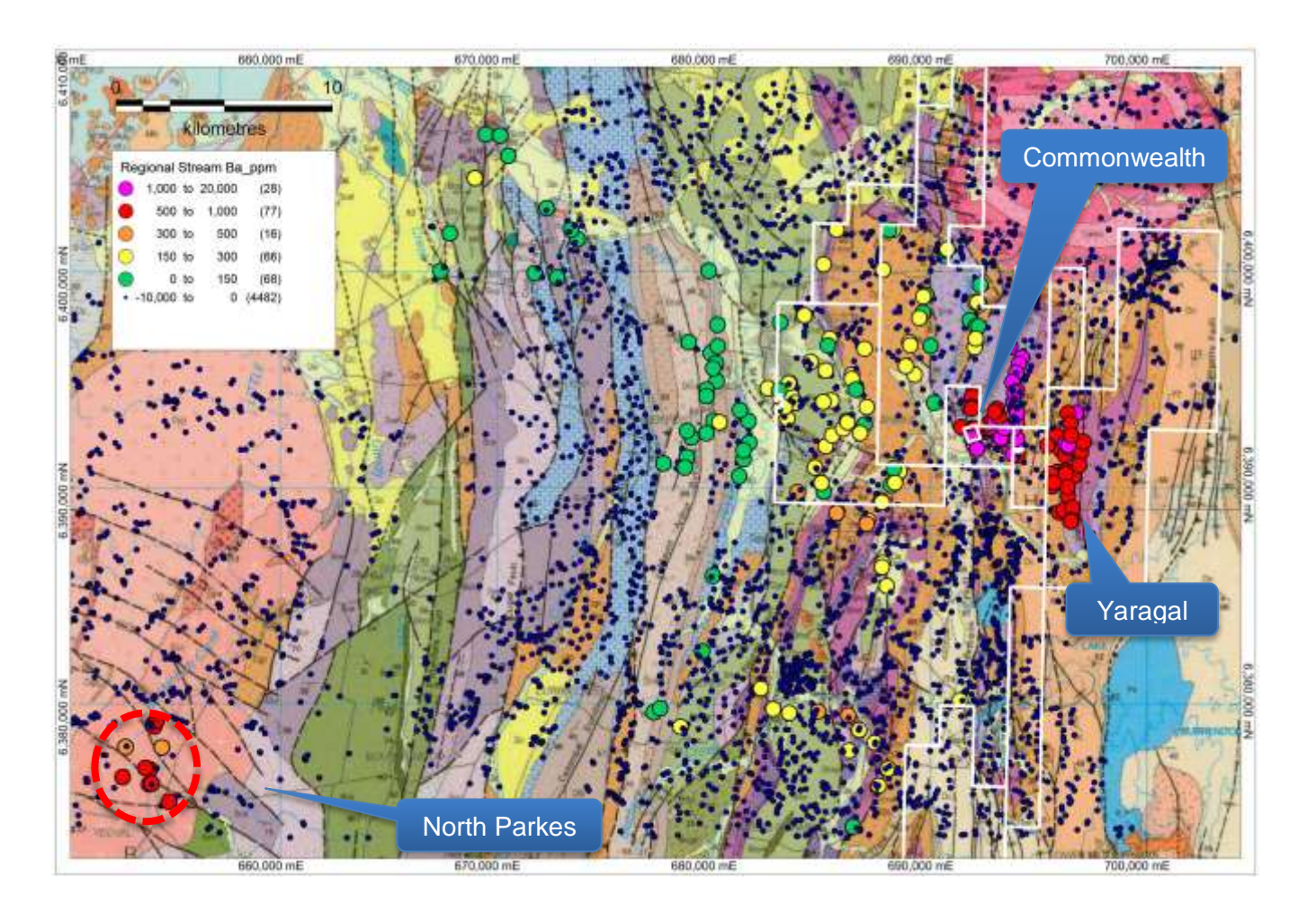
Figure 1. NSW stream sediment geochemistry assays for barium shown as point data over the regional geology map. Impact's licences are shown in white. Three areas stand out: Commonwealth, Yaragal and an area centred on the North Parkes-endeavour porphyry copper deposits.

Impact's view is that this confirms the potential, as suggested previously, that a porphyry copper-gold system may be present at depth below, and is driving the entire mineralised gold-rich VMS system, in the Commonwealth-Silica Hill-Welcome Jack area.