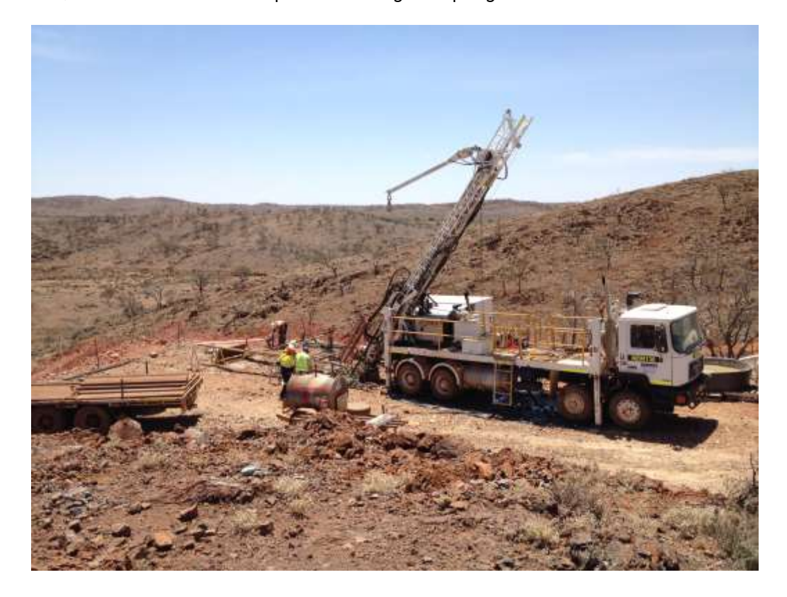
Drilling at the Red Hill Prospect

Impact recently earned a 51% in the rights to nickel-copper-PGE mineralisation from Golden Cross Resources Limited (GCR) and has elected to earn an 80% interest by spending a further $200,000. This will be completed during this programme.