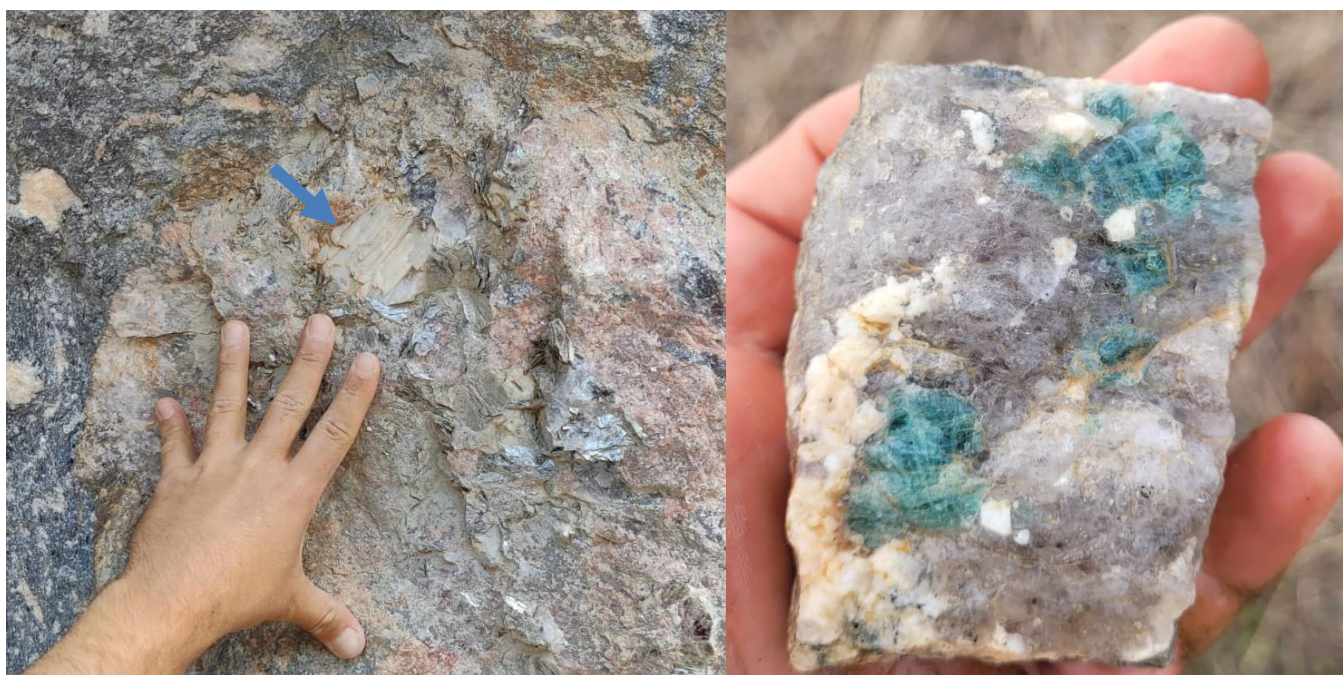
Figure 2. Outcrop of pegmatite vein with large spodumene crystal (arrow) and grab sample with yttrium-bearing apatite (aquamarine crystals).

Outcrops of pegmatite veins with large spodumene and apatite crystals have been identified at the Kalahari Prospect, part of Impact Minerals Limited's Hopetoun Project near the mining centre of Ravensthorpe in Western Australia (Figures 1, 2 and 3).