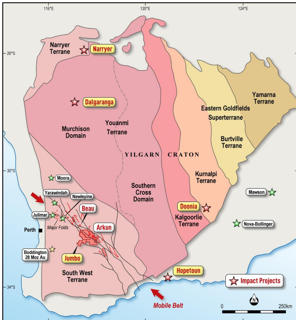
Figure 4. Location of Impact's projects in Western Australia.